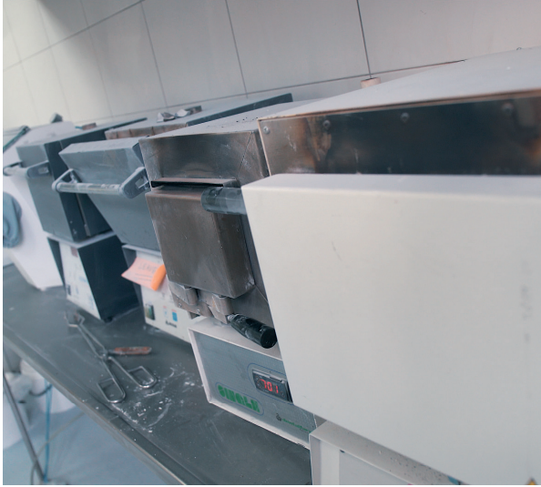
Old technology used in the casting method