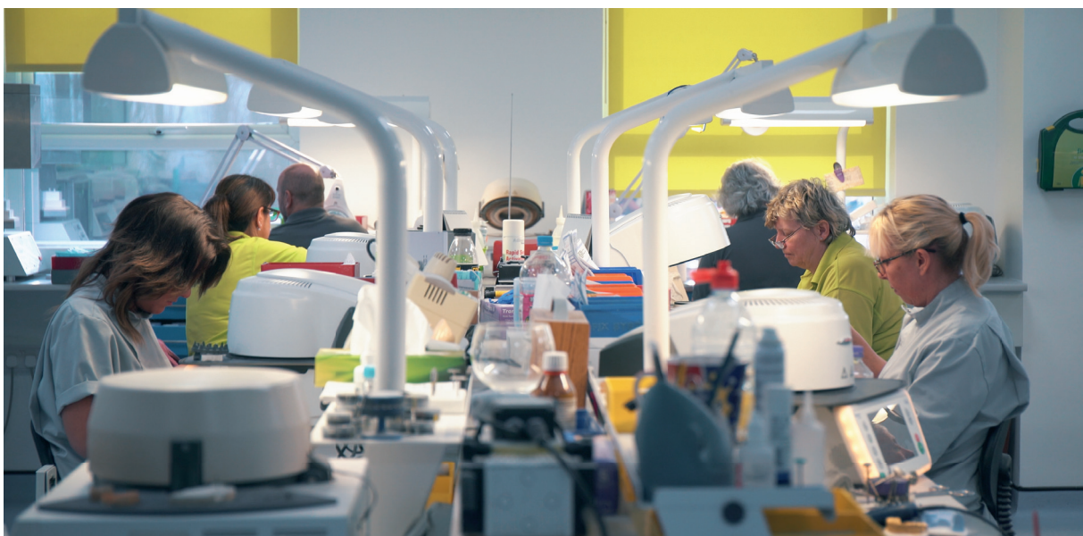
Finishing process at Swift