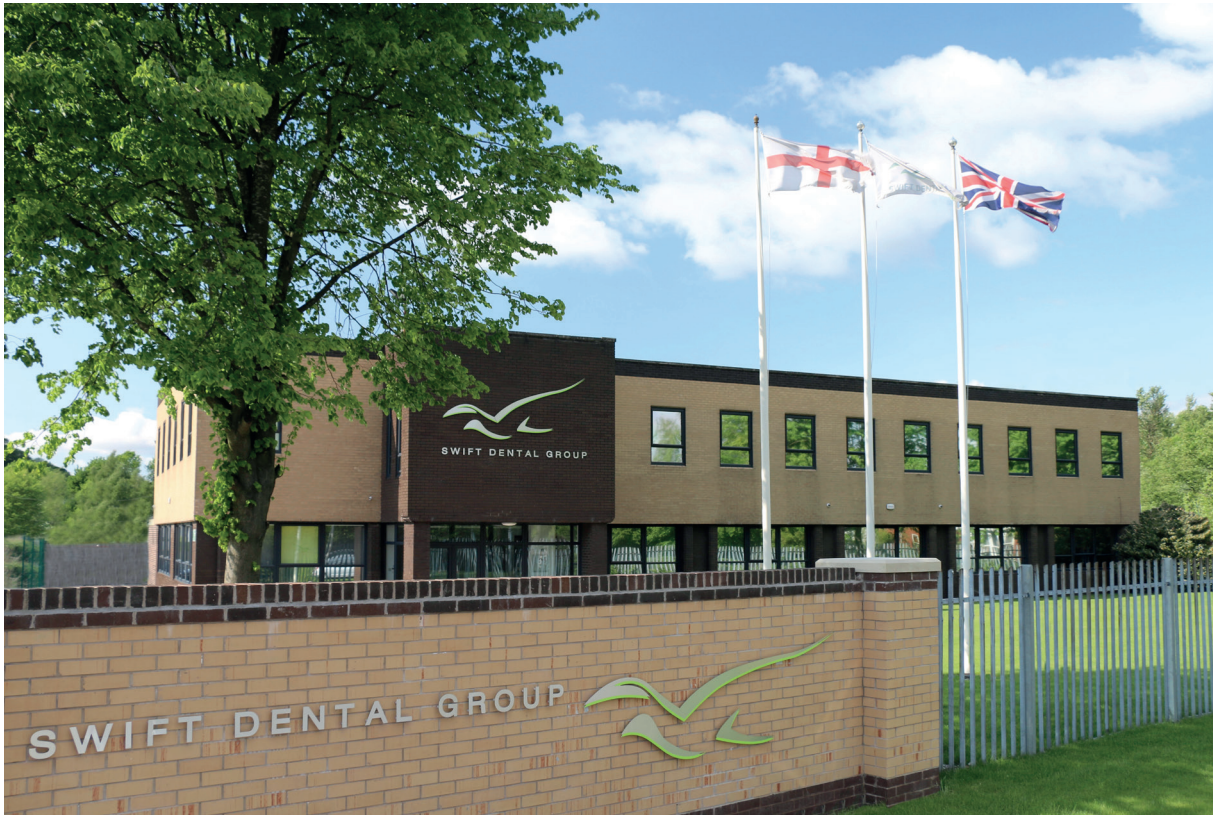
Swift Dental Group

// In-house laboratory processes are much smoother and more efficient than ever before, and the level of accuracy that we are able to achieve with the additive manufacturing processes has helped position us ahead of our competition. Previously, around two products in every ten would need a rework after the end-customer's first fitting. The AM250 has helped reduce this drastically. //